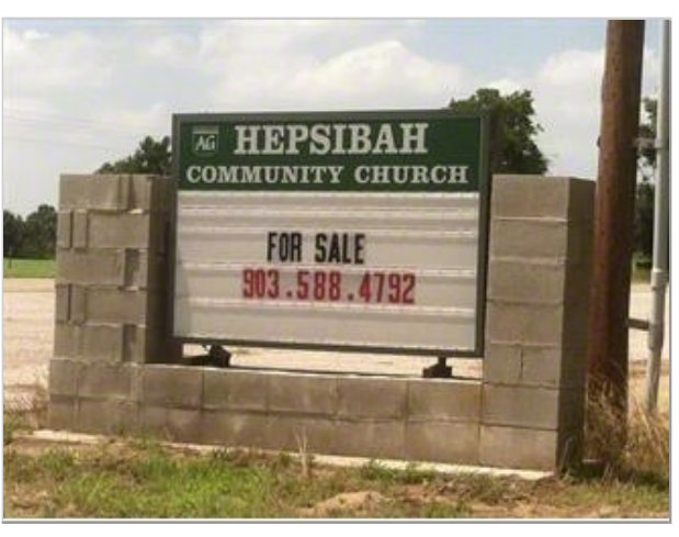
Road signage on FM 1647