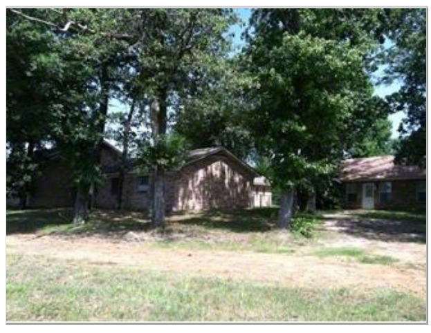
Parsonage and Fellowship Hall from the rear