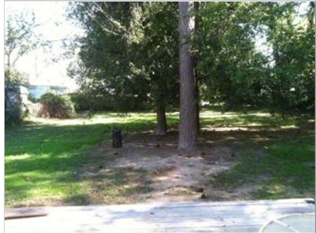
Backyard from the deck