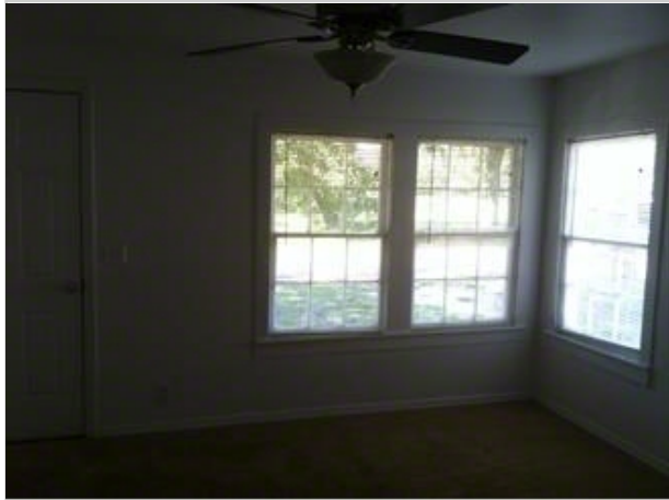
Living room looking out