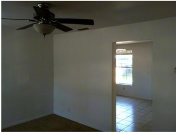
Living room looking toward the kitchen