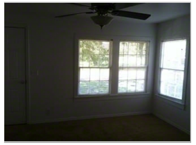
Living room looking out