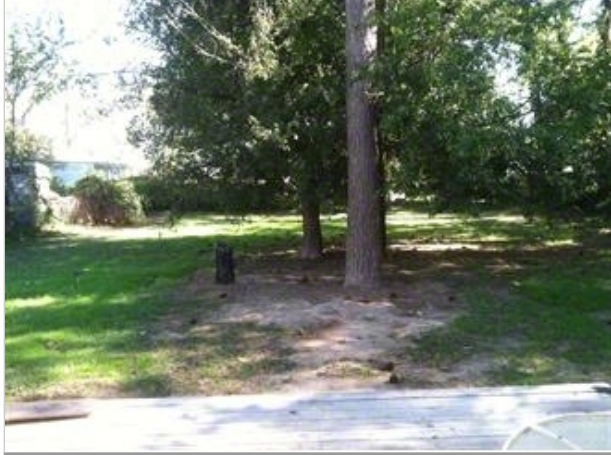
Backyard from the deck