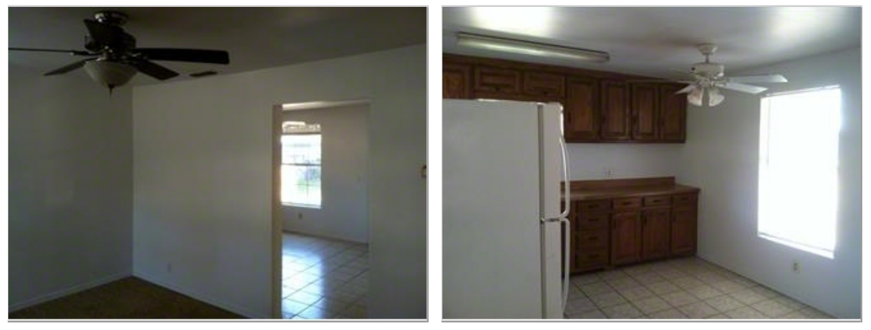
Living room looking toward the kitchen